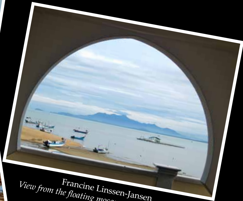
Francine Linszen-Jansen View from the floating mosque, Penang, Malaysia