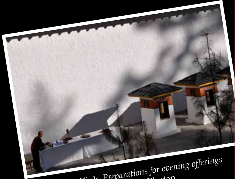
Betsy Zink, Preparations for evening offerings Thimphu, Bhutan