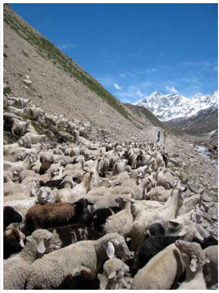
2nd Prize: SueEllen Kelso The road less travelled, Himachal Pradesh, India