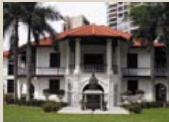
40. SUN YAT SEN VILLA (now known as Sun Yat Sen Nanyang Memorial Hall) LOCATION 12 Tai Gin Road (Gazetted on 28 October 1994)

SIGNIFICANCE Constructed in 1887-1907. It opened as a modest hotel. With the opening of the Main Hall in 1899, it became a 'grand hotel'. It is one of the most celebrated hotels in the world today.