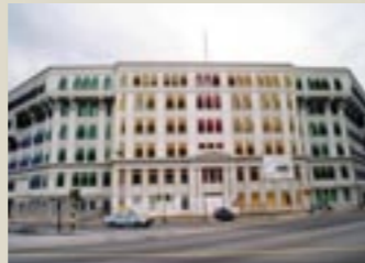
47. THE OLD HILL STREET POLICE STATION (now known as MICA Building) LOCATION 140 Hill Street (Gazetted on 18 August 1998)

SIGNIFICANCE Constructed the Caldwell House in 1840 – 1841 and the Chapel in 1890. This complex of convent buildings has a Gothic-style chapel. It was used as a Catholic Convent for 131 years. Now, it houses ethnic restaurants, shops and a function hall. It won a 'Merit Award' in the UNESCO Asia Pacific Heritage Awards for Cultural Heritage Conservation in 2002.