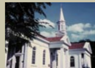
4. CATHEDRAL OF THE GOOD SHEPHERD LOCATION 'A' Queen Street (Gazetted on 6 July 1973)

SIGNIFICANCE Constructed between 1835-1836. Better known as "the Armenian Church", it is the oldest Christian church in Singapore. It was built by the early Armenian migrants – a small, pious, wealthy community. Named after a 4th century monk, the church is sometimes used for Russian Orthodox and Greek Orthodox services.