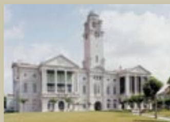
53. VICTORIA THEATRE AND VICTORIA CONCERT HALL LOCATION 9 Empress Place (Gazetted on 14 February 1992)

SIGNIFICANCE Constructed in 1937-1939. It was the last colonial classical building constructed in Singapore. The columns and pediment sculpture were created by Italian sculptor Cavalier Rudolfo Nolli of Milan.