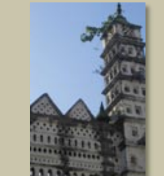
11. NAGORE DURGHA SHRINE LOCATION 140 Telok Ayer Street (Gazetted on 29 July 1974)

SIGNIFICANCE Constructed by 1878. Maghain Aboth is the oldest Jewish synagogue in Southeast Asia. Till today, there are still several Jewish buildings standing within its vicinity. Descendants of some of Singapore's earliest Jewish settlers are still living and doing business in Singapore.