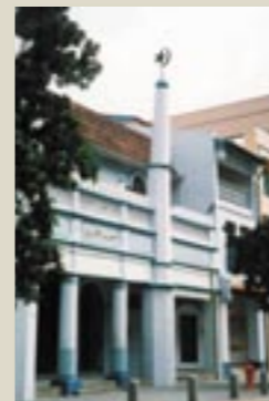
2. AL-ABRAR MOSQUE LOCATION 192 Telok Ayer Street (Gazetted on 29 November 1974)

SIGNIFICANCE Constructed in 1907. Originally in 1859, on this site stood a mosque of timber partitions and tiled rooftop. Shophouses were added to it (1887-1903) to generate rental income to build the new mosque. These premises are now used for classes and community activities. Major restoration was completed in 2003.