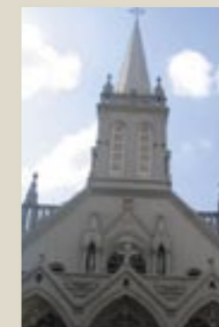
6. CHURCH OF ST PETER AND ST PAUL LOCATION 225A Queen Street (Gazetted on 10 February 2003)

SIGNIFICANCE Constructed in 1905. As the Jewish community grew beyond the capacity of the Maghain Aboth Synagogue, there was a need for this second place of worship, built in the late-Renaissance style. It was also one of the first places to use gaslights in Singapore.