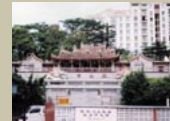
8. HONG SAN SEE TEMPLE LOCATION 31 Mohamed Sultan Road (Gazetted on 10 November 1978)