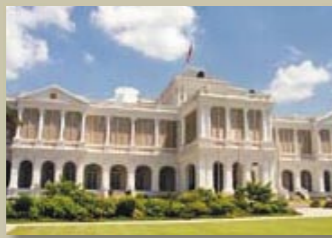
43. THE ISTANA AND SRI TEMASEK LOCATION Orchard Road (Gazetted on 14 February 1992)

SIGNIFICANCE Constructed in 1890-1894. The building was built on reclaimed land, which was made of cast iron from Glasgow, Scotland. Now fully-restored, it is home to many popular local food stalls, which is collectively known as Lau Pa Sat Festival Market, located in the heart of the financial district.