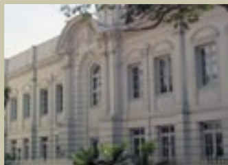
45. THE OLD ATTORNEY GENERAL'S CHAMBERS LOCATION 3 High Street (Gazetted 14 February 1992)

SIGNIFICANCE Constructed in 1939. This building was used by the British armed forces for strategic planning in World War II. It was also used as the residence of British Royal Navy Commander-in-Chief, Far East Station.