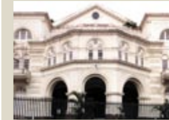
5. CHESSED-EL SYNAGOGUE LOCATION 2 Oxley Rise (Gazetted on 18 December 1998)

SIGNIFICANCE Constructed between 1843-1846. The first Roman Catholic church in Singapore was built in 1833 on the site which is now occupied by the Singapore Art Museum. The growing congregation needed a bigger church which became a cathedral when it was consecrated in 1897. During the Japanese invasion in World War II, the cathedral was used as an emergency hospital.