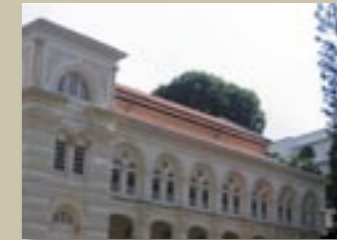
10. MAGHAIN ABOTH SYNAGOGUE LOCATION 24 & 26 Waterloo Street (Gazetted on 22 February 1998)

SIGNIFICANCE Constructed (re-built) 1830-1835. Built by the Chulia Muslim merchants from South India, thus it is also known as the Chulia Mosque. Believed to be among the oldest mosques here and it is a well-known landmark in Chinatown.