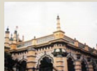
1. ABDUL GAFFOOR MOSQUE LOCATION 41 Dunlop Street (Gazetted on 13 July 1979)

SIGNIFICANCE Constructed in 1907. Originally in 1859, on this site stood a mosque of timber partitions and tiled rooftop. Shophouses were added to it (1887-1903) to generate rental income to build the new mosque. These premises are now used for classes and community activities. Major restoration was completed in 2003.