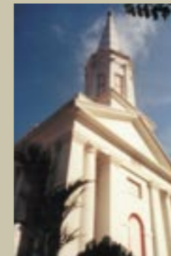
3. ARMENIAN CHURCH OF ST GREGORY THE ILLUMINATOR LOCATION 60 Hill Street (Gazetted on 6 July 1973)

SIGNIFICANCE Constructed between 1850-1855 as an Indian Muslim mosque. This building is shown in an 1856 painting by Percy Carpenter titled "Telok Ayer Street as seen from Mount Wallich". Major renovations (1986-1989) were made to the original architecture.