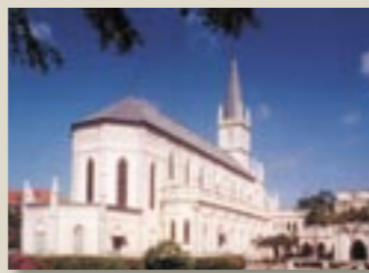
46. THE OLD CONVENT OF THE HOLY INFANT JESUS CHAPEL AND CALDWELL HOUSE (now known as Chijmes Hall) LOCATION 30 Victoria Street (Gazetted on 26 October 1990)

SIGNIFICANCE Constructed in 1864. Rebuilt 1906. Formerly the Court House and the first Government Printing Office. Subsequently, it was used as the Attorney General's Chambers. It is now part of the Parliament.