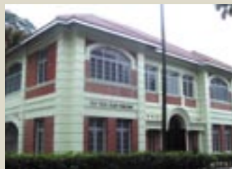
41. TAN TECK GUAN BUILDING LOCATION 16A College Road (Gazetted on 2 December 2002)

SIGNIFICANCE Constructed in 1900-1902. Once named Wan Qing Yuan , it was used by Dr Sun Yat Sen as a base for preparations to overthrow the Manchu Dynasty. The building has been restored and is now known as Sun Yat Sen Nanyang Memorial Hall, which traces Dr Sun's revolutionary activism in Southeast Asia.