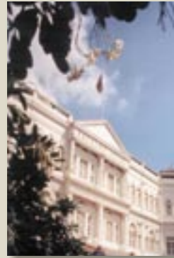
39. RAFFLES HOTEL LOCATION 1 Beach Road (Gazetted on 6 Mar 1987; re-gazetted 3 Jun 1995)

SIGNIFICANCE Constructed in 1887-1907. It opened as a modest hotel. With the opening of the Main Hall in 1899, it became a 'grand hotel'. It is one of the most celebrated hotels in the world today.