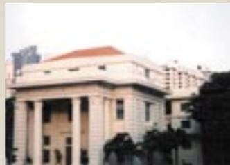
48. THE OLD MINISTRY OF LABOUR BUILDING (now known as Family & Juvenile Court of Singapore) LOCATION Havelock Road (Gazetted on 27 February 1998)

SIGNIFICANCE Constructed in 1934. It was a site of Singapore's first prison. Built in Neo-Classical style, this building was the largest government building at that time. The building has been restored and is now known as the MICA (Ministry of Information, Communications and the Arts) Building.