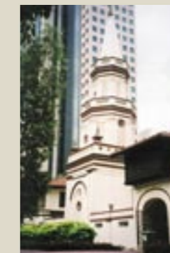
7. HAJJAH FATIMAH MOSQUE LOCATION 4001 Beach Road (Gazetted on 6 July 1973)

SIGNIFICANCE Constructed in 1870. It was erected by the Chinese Catholic Mission serving a congregation of all the Chinese dialect groups and their Indian Catholic brethren. It was also a centre for many European missionaries who needed to learn the Chinese language before other postings.