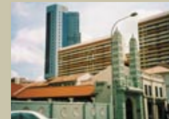
9. JAMAE MOSQUE LOCATION 218 South Bridge Road (Gazetted on 29 November 1974)

SIGNIFICANCE Constructed between 1908-1913. Erected by migrants from Nan An town in Fujian province with materials imported from China. Built on a small hill, it once overlooked the sea. Now, it views a thriving pubbing district and expensive apartments.