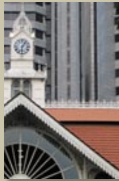
42. TELOK AYER MARKET (now Lau Pa Sat Festival Market) LOCATION 18 Raffles Quay (Gazetted on 6 July 1973)