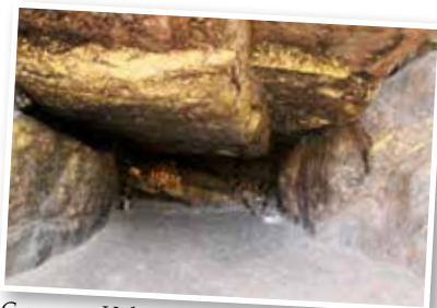
Cave near Vulture Peak with gold leaf pasted on the rocks