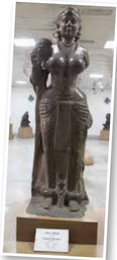
Patna Museum - chauri bearer