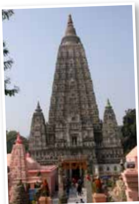
The Mahabodhi Temple