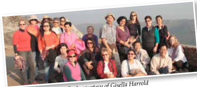
Group photo at Vulture Peak, courtesy of Gisella Harrold