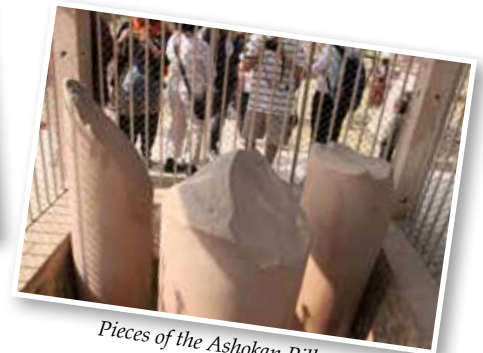
Pieces of the Ashokan Pillar in Sarnath

A journey is best measured in friends, rather than miles. (Tim Cahill)