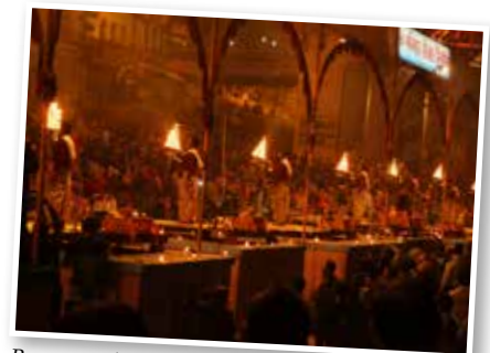
Benares - the Ganga aarti ceremony