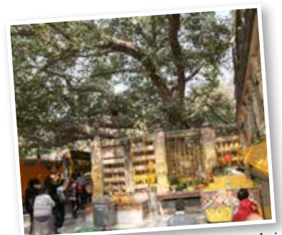
The bodhi tree at the Mahabodhi Temple in Bodh Gaya