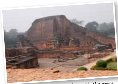
Ruins of Nalanda University with the great stupa in the rear